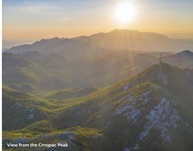
View from the Crnopac Peak

You can reach the peak by following the marked hiking trails "Prezid - Veliki Crnopac" and "Prezid - Mountain shelter Crnopac - Veliki Crnopac".