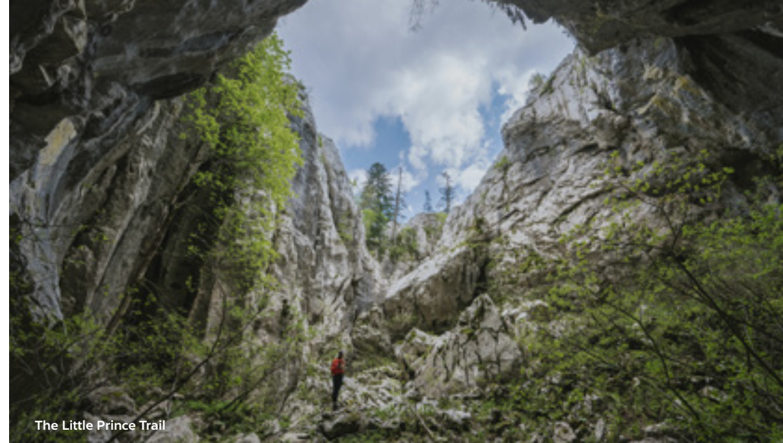
The Little Prince Trail